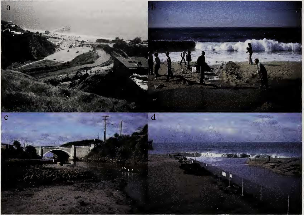
Fig. 1. a) Aliso Creek Lagoon, closed to the ocean photo, 2 December 1973 (Swift et al. 1989); b) Trench being dug at mouth of Aliso Creek Lagoon, 2 December 1973; c) Recently drained lagoon from upstream end, 2 December 1973, d) Surf naturally rebuilding barrier berm at Aliso Creek Lagoon, 2 December 1973.

a site extensively studied due to the presence of endangered species and water quality concerns about municipal and agricultural wastewater 1 ; and Corcoran Lagoon (Rodeo Gulch), Santa Cruz County, with a much smaller freshwater drainage upstream than the former two. Breaching of the lagoons was observed directly at Aliso Creek and within hours before and/or after breaching at the Santa Clara River and Corcoran Lagoon.